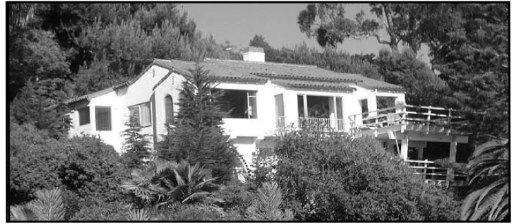
Historic home at 31351 Coast Highway

No one who now owns a legal building site and no one whose development application is deemed complete when the ordinance goes into effect will be affected by the change. ≈