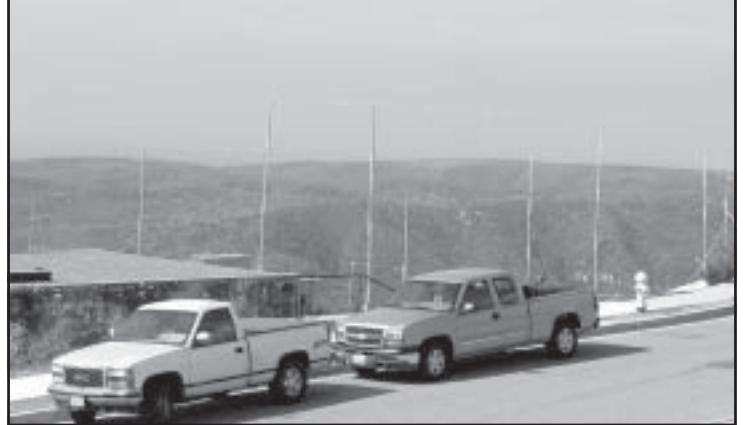
Stakes outline the house proposed at 3355 Alta Laguna Boulevard opposite Alta Laguna Park

To receive any further extension, the Montage will be required to demonstrate that its employees are not parking anywhere except in designated lots and not occupying any other business's required parking spaces. It will also have to participate in good faith in discussions with the City regarding a permanent solution to the resort's parking problem. The landscaping improvements proposed will not be required in the interim. ≈