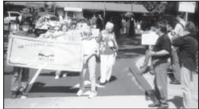
Some of Village Laguna's '04 parade contingent

We'll meet in the Wells Fargo Bank 3d Floor Community Room on Monday, February 28, at 7 p.m. ≈