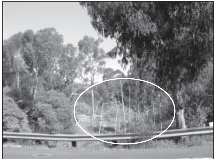
Stakes outline the "dip house" on Glenneyre St., between Caliope and Bluebird Canyon

The Planning Commission and the Design Review Board will hold a joint meeting on February 23 at 6 p.m. in the Council Chambers to review how the anti-mansionization measures are working. I hope to see you there! ≈