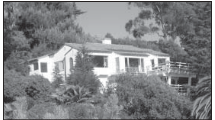
Historic home at 31351 Coast Highway

The proposed development at 31351 Coast Highway, originally scheduled for a fourth hearing before the Design Review Board on June 2, will now be heard only in mid-July. Given the board members' concerns and those of the community about the demolition of the E-rated structure, it may be that some modification of the plans is in the works. ≈