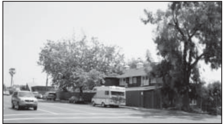
Glenneyre St. Pottery Shack building and sycamore tree

Perhaps demonstrating the need to be careful what you wish for, the City Council last week approved in concept a proposal to demolish the Glenneyre St. building and remove the sycamore tree that shades it to build an underground parking structure for 45 cars. The proposal is to devote 10 spaces to the development's own parking deficit and allow the leasing to the city or to other businesses of the remaining spaces. (It may be recalled that the original proposal also envisioned creating "excess" spaces on paper with a 75% parking reduction incentive and this idea was rejected.) The original building would be replaced by a new one set