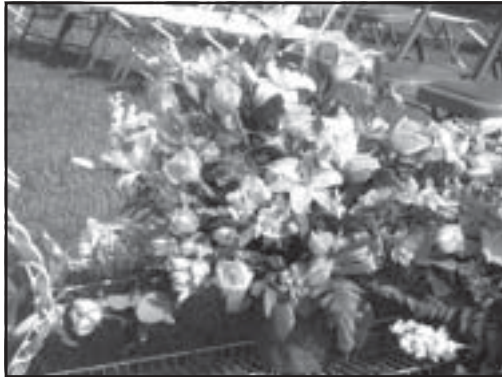
Floral arrangement from Village Laguna provided for the May 31, 2005 Memorial Day celebration at Heisler Park