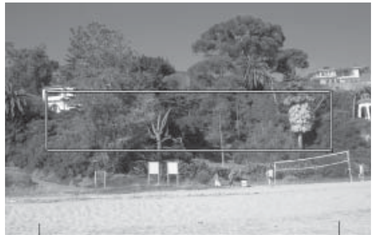
Approximate placement of building