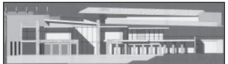
Architectural rendition of proposed house, approximate size as it would appear on property shown above