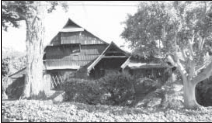
The Malcolm St. Clair House

are the wooden floors. The garage has two swinging doors and is called a “Model A” garage. The authentic water pump and brick well in the kitchen are original.